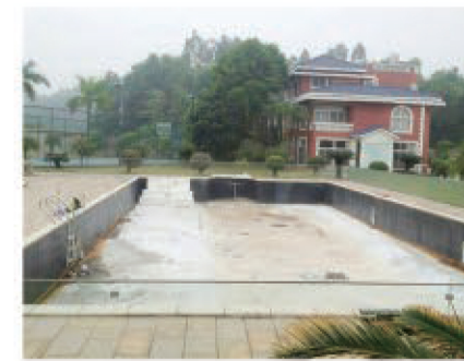
1 Surface smoothing