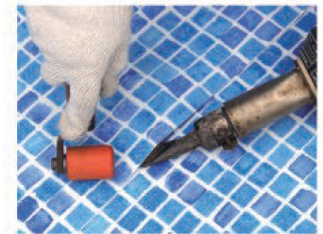
6 Floor laying and welding