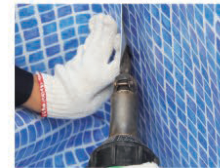
5 Wall laying and welding