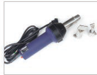
Hot air welding machine