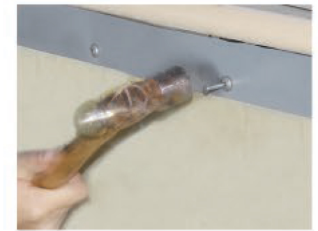
3 Installation of hung profile or PVC coated metal