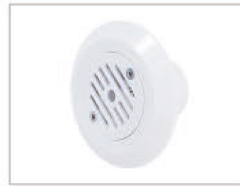
Water inlet/water outlet