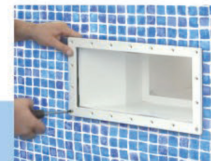
8 Installation of hydraulic accessories (water inlet/outlet, lights, etc.)