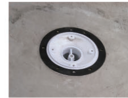
2 Installation of embedded parts