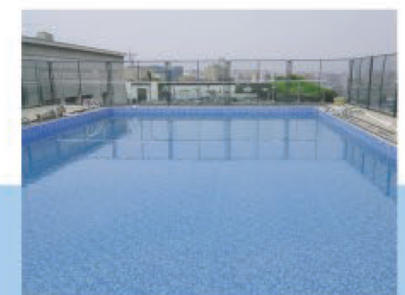
9 Acceptance inspection